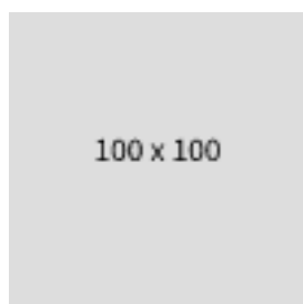
(a) fig a