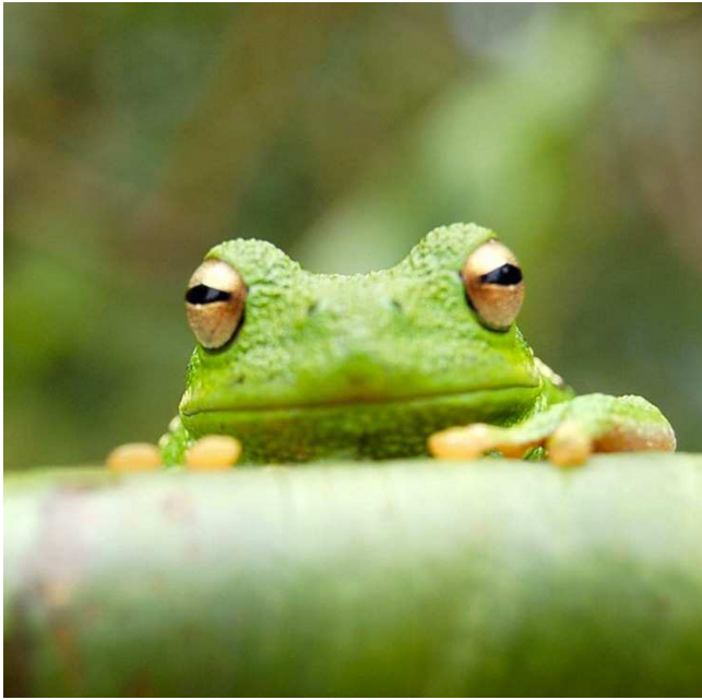
Figure 2. This legend would be placed at the side of the figure, rather than below it.

249 250 251 252 253 254 255 256 257 258 259 260 261 262 263 264 265 266 267 268 269 270 271 272 273 274 275 276 277 278 279 280 281 282 283 284 285 286 287 288 289 290 291 292 293 294 295 296 297 298 299 300 301 302 303 304 305 306 307 308 309 310